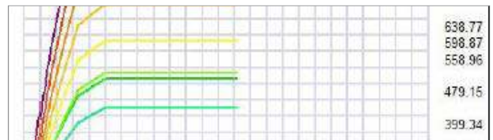
p-y curve generation for lateral analysis of drilled pier.